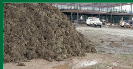
Figure 3. Site preparation eliminates populations of beneficial mycorrhizal fungi.

Soils in natural settings are full of beneficial soil organisms including mycorrhizal fungi. However, research indicates that many common landscape practices such as site preparation, grading, removal of natural vegetation and heavy use of chemical pesticides and fertilizers often degrade the mycorrhiza-forming potential of soil. Construction site preparation activities such as removal of topsoil, compaction, erosion and simply leaving soils bare can also reduce or eliminate healthy and diverse populations of mycorrhizal fungi (Amaranthus et al. 1996; Doer et al. 1984; Dumroese et al. 1998, Amaranthus and Steinfeld 2003, Rider et al. 2007).