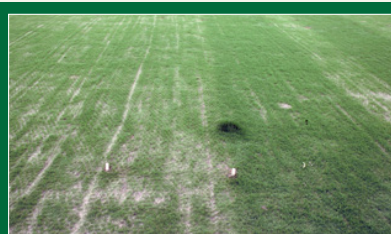
Figure 4. Creeping Bentgrass cover with mycorrhizal inoculation (Right) and cover in control Area (Left).

Water conservation awareness has increased as water becomes an increasingly expensive and environmentally sensitive component of turf management. Research has shown that mycorrhizae can reduce moisture stress in grasses (Koske et al 1995; Auge et al. 1995; Allen et al. 1991). Studies published in Journal of Turfgrass Science state that creeping bentgrass inoculated with mycorrhizal fungus tolerated drought conditions significantly longer than non-mycorrhizal turf (Gemma et al. 1997). Mycorrhizal-inoculated turf also recovered from drought-induced wilting more quickly than non-mycorrhizal turf. The data also shows that mycorrhizal turf maintained significantly higher (avg. 29% more) chlorophyll concentrations than non-mycorrhizal turf during drought events.