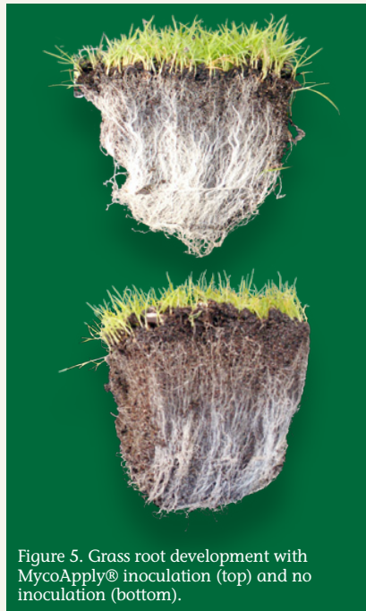
Figure 5. Grass root development with MycoApply® inoculation (top) and no inoculation (bottom).

*Full references to this article are available at www.mycorrhizae.com .